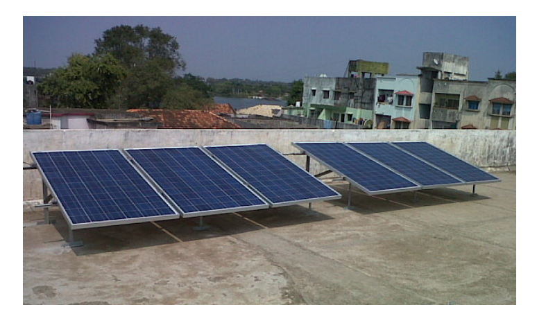
Komti Samaj - Chandrapur