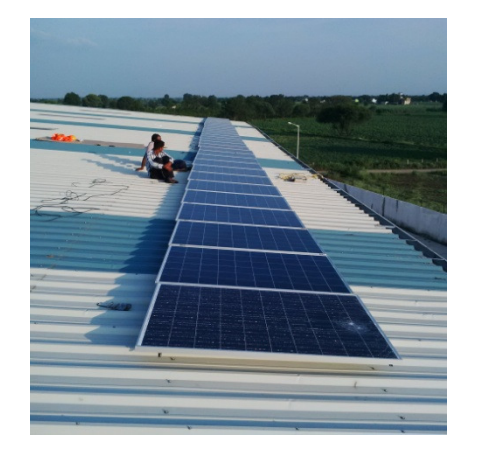
VRL - Waluj