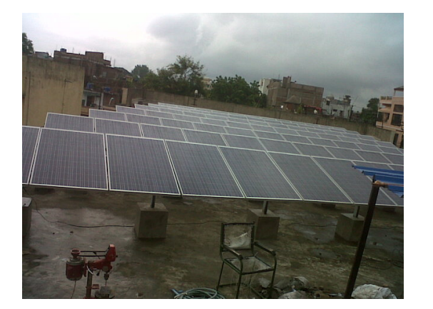
NMC – Aasi Nagar