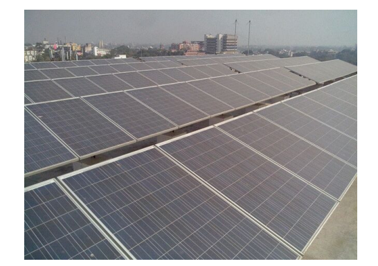
NMC – Main Blg