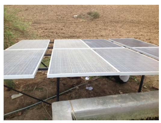
Adhau Farm House