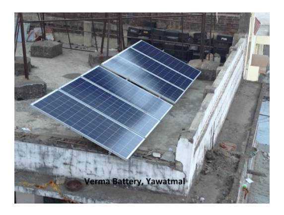
Verma Batt - Yawatmal