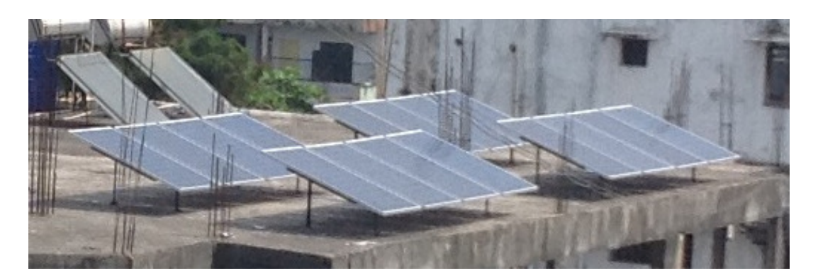
H P World - Nagpur