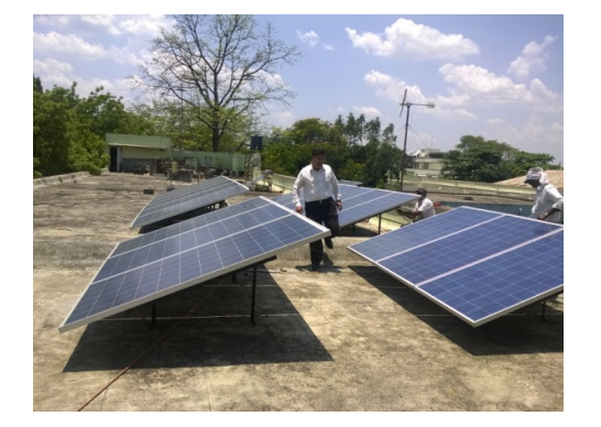
VNIT - Nagpur