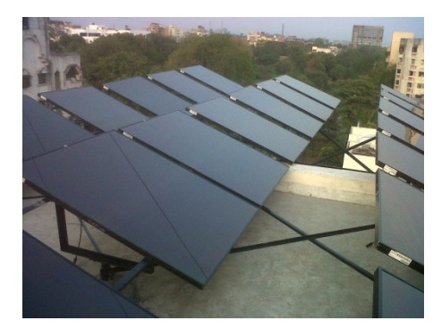
B.Algo HO - Nagpur