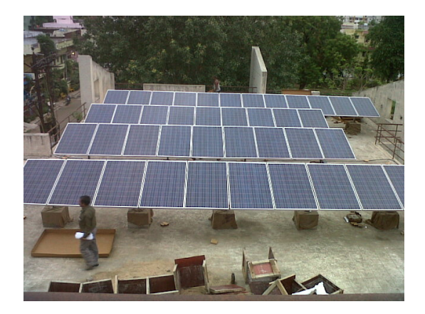
NMC – Nehru Nagar