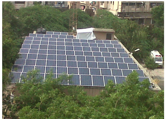
NMC – Lakadganj