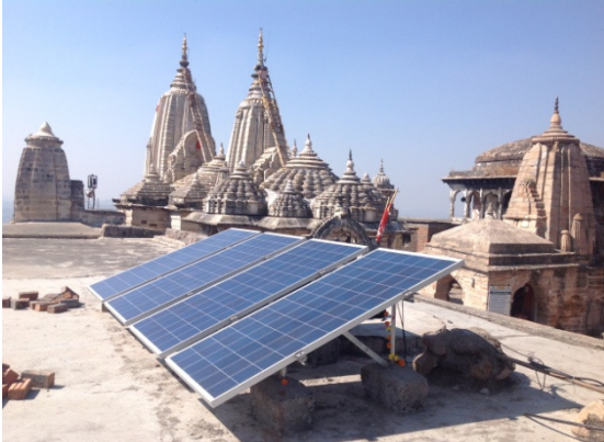
Ram Mandir – Ramtek