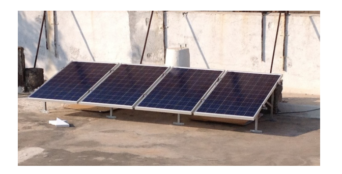
Verma Tractor - Yawatmal